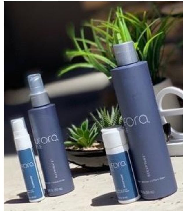
EUFORA Sculpture Light Styling Glaze & Illuminate Shine Mist